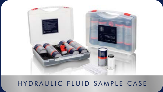
HYDRAULIC FLUID SAMPLE CASE