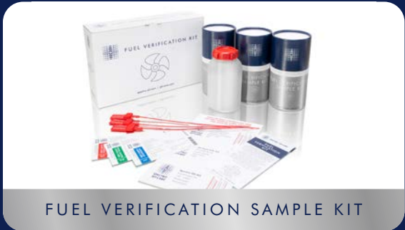
FUEL VERIFICATION SAMPLE KIT