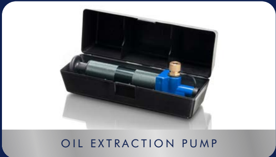
OIL EXTRACTION PUMP