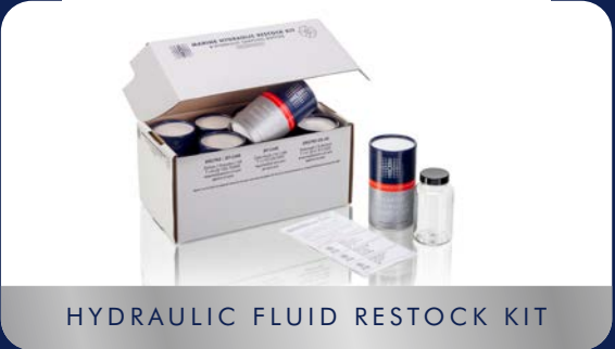
HYDRAULIC FLUID RESTOCK KIT