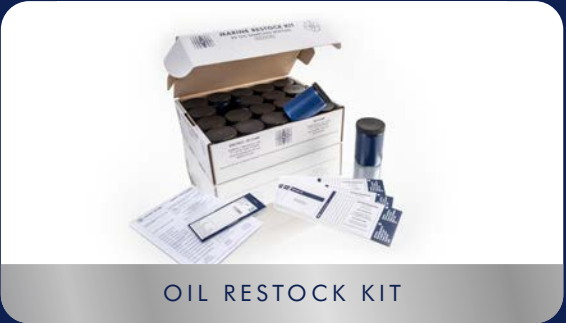
OIL RESTOCK KIT