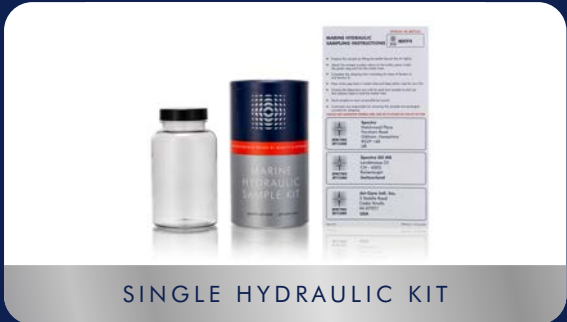
SINGLE HYDRAULIC KIT