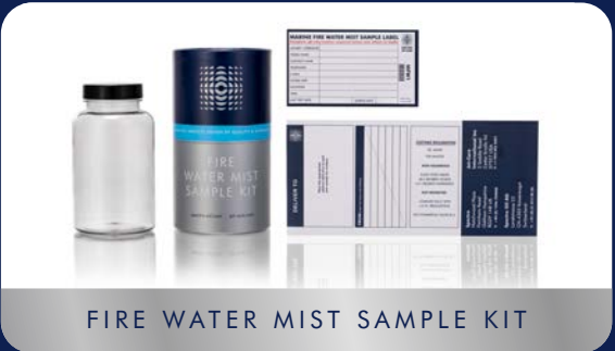
FIRE WATER MIST SAMPLE KIT