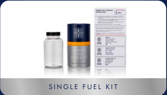
SINGLE FUEL KIT