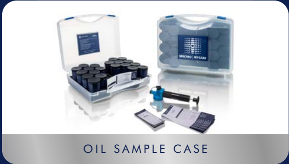
OIL SAMPLE CASE